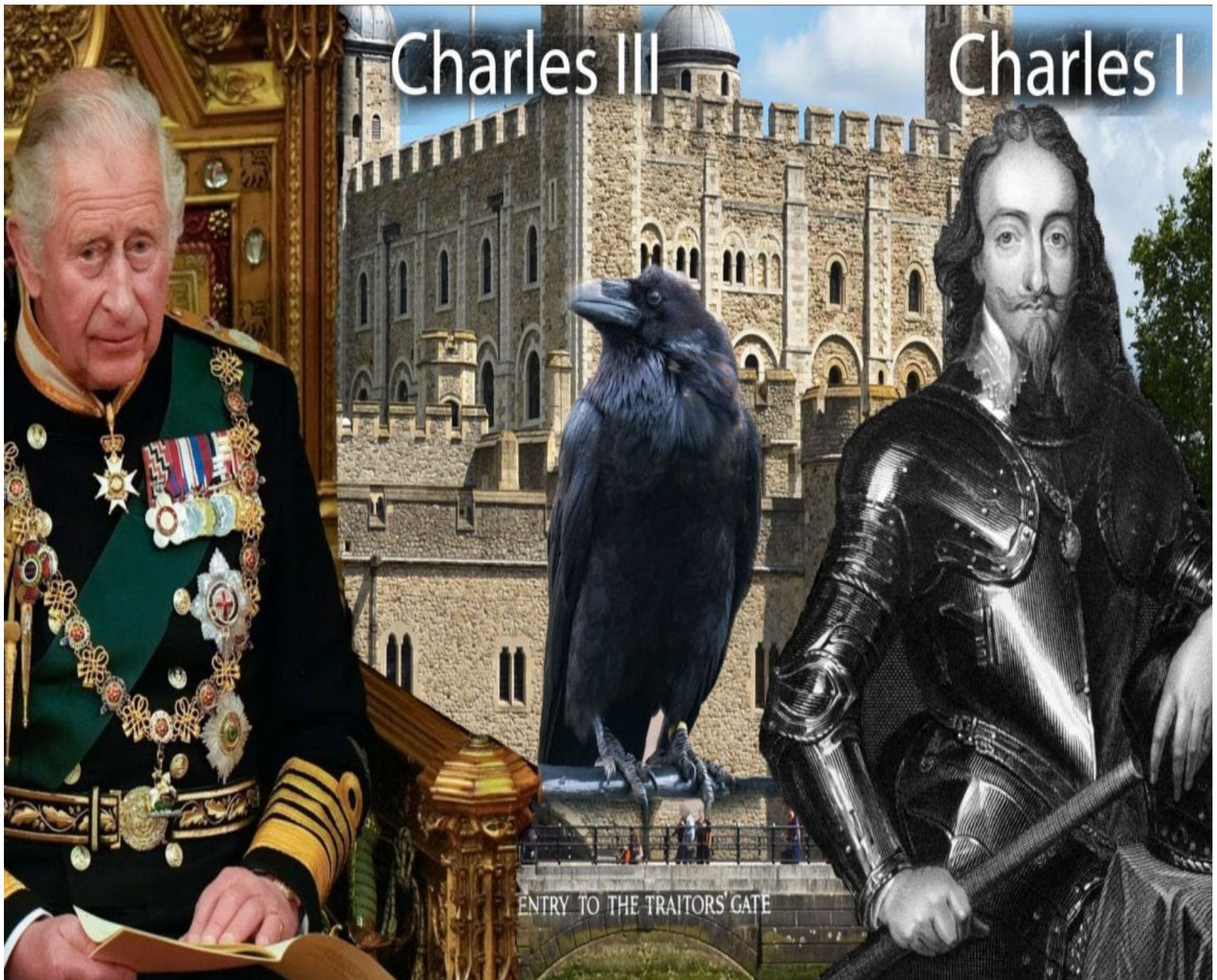
King Charles III (left), a Raven waiting to feast of the executed (back in the day) and right, adjudged traitor and enemy of the peoples of England & Wales, Charles I