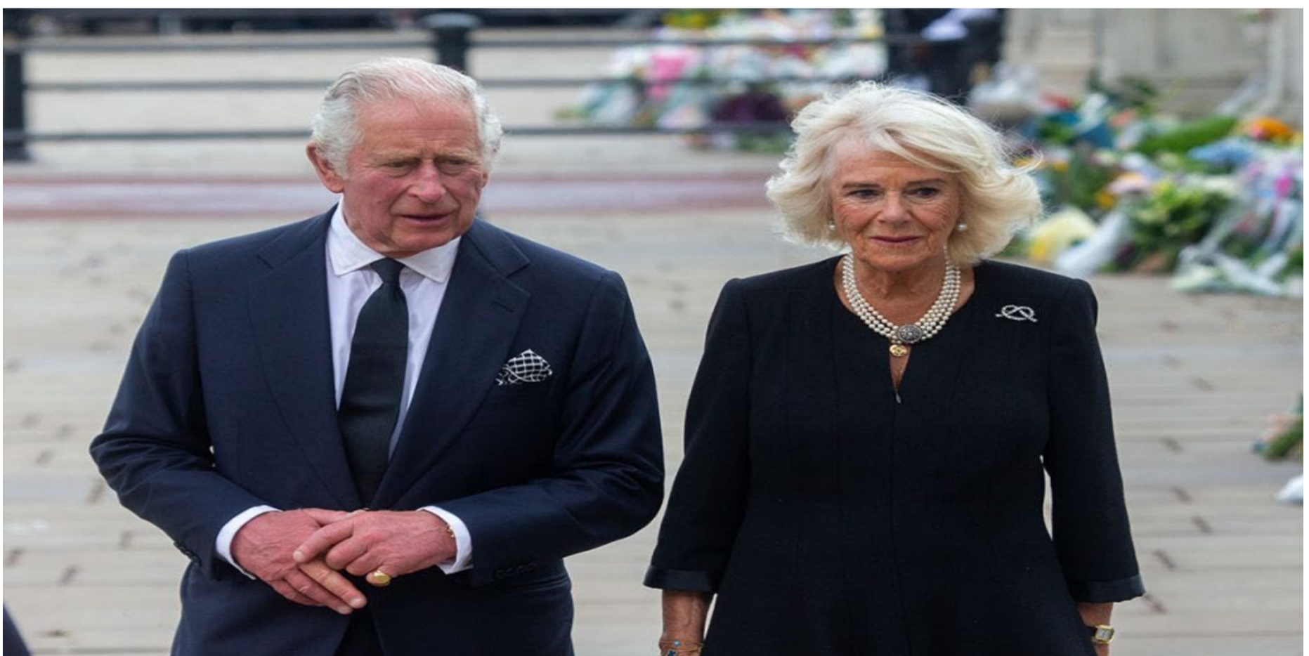
London: September 09 2022 King Charles III and Queen Consort Camilla are seen outside Buckingham Palace

It is our finding and belief that in truth and reality, Charles III has vitiated it, and that neither he, nor Queen Consort can take it. Government, Ministers under the Crown and its judges are proven to be lawless and there is no judicial independence.